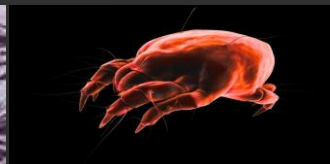
MICRO-FINE DUST AND DUST MITES