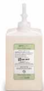
OptiSource® Pink Foam lotion Soap