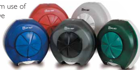
Available in five translucent colors: Black, Green, Red, White and Blue.

The Revolution® 3-roll tissue dispensing system is designed for high-capacity controlled-use dispensing of OptiCore® tissue products. When one roll of tissue is used, simply turn the dial to advance to the next roll. The OptiCore® technology ensures the maximum use of each roll in the Revolution® dispenser to save maintenance time and costs. This sleek, contemporary dispenser also features a locking cover to prevent product pilferage and waste. The Revolution® dispenser is available in five color choices and can be custom imprinted for a unique, coordinated washroom appearance.