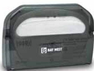
Available in five translucent colors: Black, Green, Red, White and Blue.