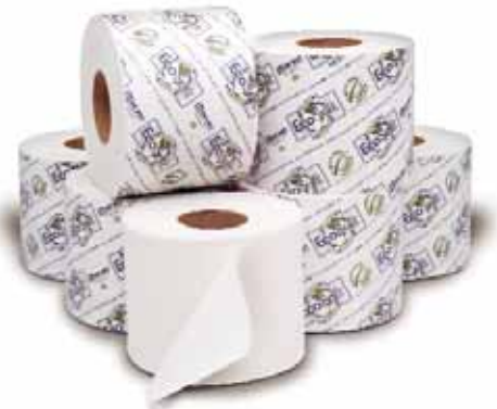
EcoSoft™ Green Seal™ Controlled-Use Tissue