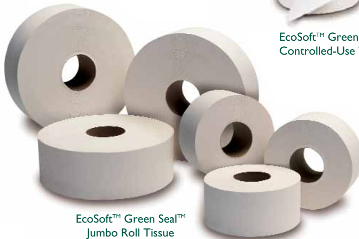
EcoSoft™ Green Seal™ Jumbo Roll Tissue