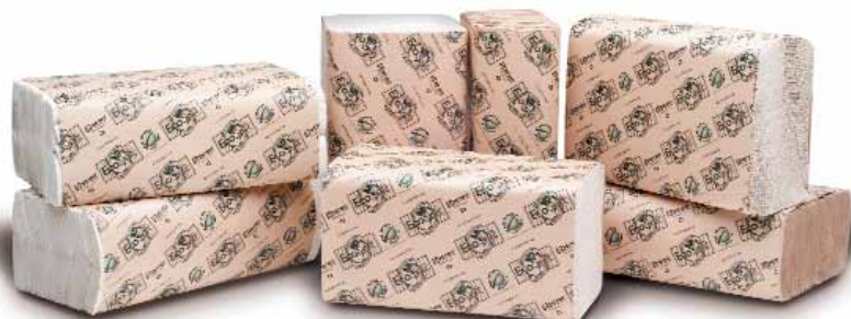
EcoSoft™ Green Seal™ Multifold, Singlefold and C-fold Towels