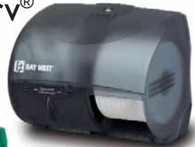
Available in five translucent colors: Black, Green, Red, White and Blue.