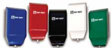
Available in five colors: Black, Green, Red, White and Blue.

The Bay West® OptiSource® dispensing system is designed for use with either foam or liquid soap. To dispense the foam soap products, the actuator stays in place. The back is made with slots for easy mounting and features a one-hand push design for easy operation. The compact size also makes it ideal for applications where space is a consideration.