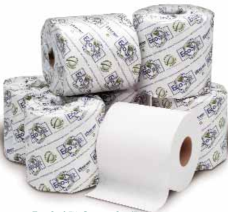
EcoSoft™ Green Seal™ Universal Tissue